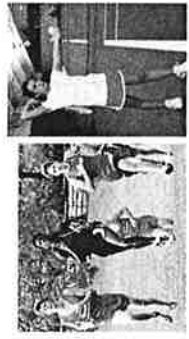
More than a third of Park athletes earn a G.P.A. of 3.5 or better!