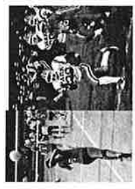
Partake in community service