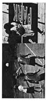
Earn your 3 sport athlete patch!